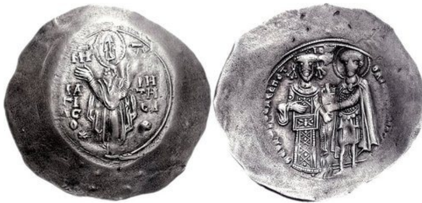
2. His father in law Theodore Komnenos Doukas Angelos (1215–1230).