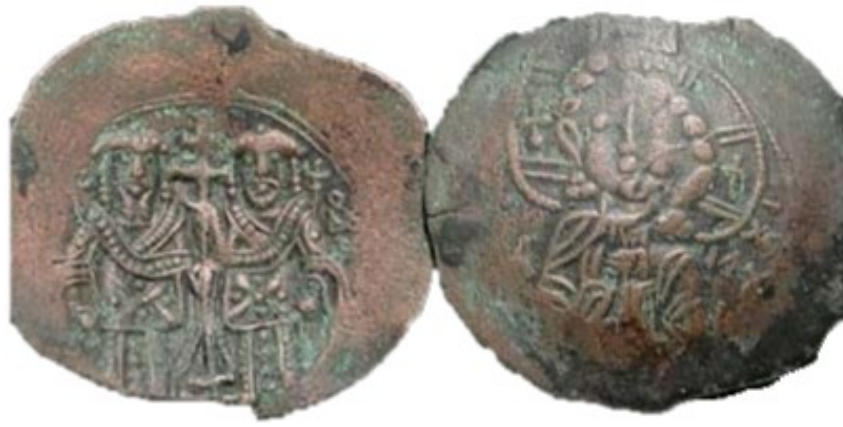
5. Husband of his cousin John III Doukas Vatatzes (1222-1254).

Type 2. 7 copper “Mary mother of Jesus blessing the king” type coins with Greek legend ΣΤΕΦΑΝΟΣ ΡΙΖ on the left side, Greek initials ΜΡ (mother) in the middle and ΘΥ (of god) on the right side on the reverse. King is holding a globe wearing a 6 dot belt and a long robe with a single dotted line in the middle and Mary is wearing a long robe. Jesus enlarged sitting with Latin legend IC XC above but no visible throne in the background on the obverse. (Coins number: 8, 16, 27, 30, 34 and 46).