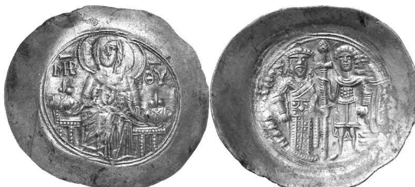
3. His uncle Manuel Komnenos Doukas Angelos (1230-1237).