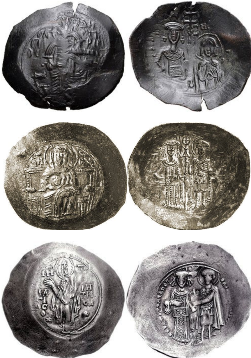
2. His father in law Theodore Komnenos Doukas (1215–1230).