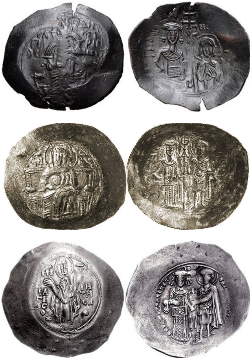
2. His father in law Theodore Komnenos Doukas Angelos (1215–1230).