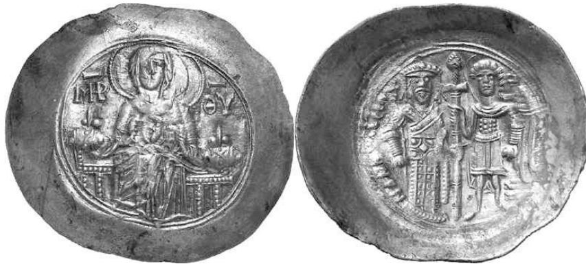
3. His uncle Manuel Komnenos Doukas Angelos (1230-1237).