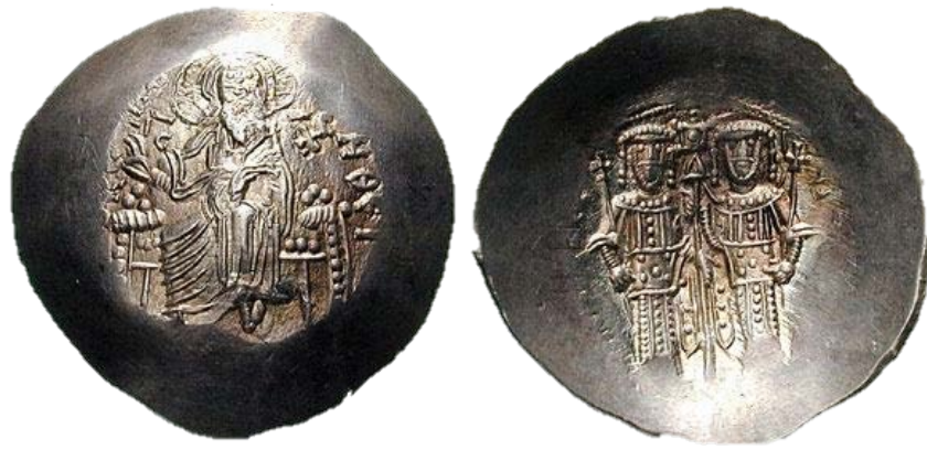
1. His grandfather Alexios III Angelos Komnenos (1195–1203).