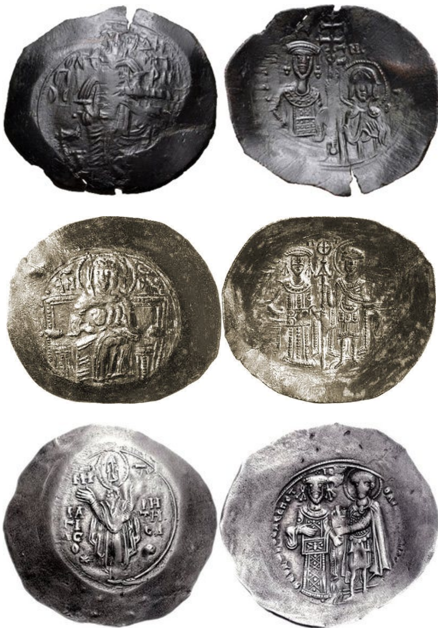
2. His father in law Theodore Komnenos Doukas Angelos (1215–1230).