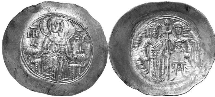
3. His uncle Manuel Komnenos Doukas Angelos (1230-1237).