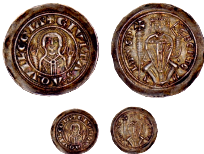
3565 Bertoldo of Andechs-Meran (1218-1251). Denaro. ✚ • CIVITAS • AQVILEGIA •. Bust of the Virgin Mary orans. Rv. BERTO LDVSP. The seated patriarch facing, wearing mitre, holding long cross and book of Gospels. AR 1.19 grams, 9h. Bernardi 16. Very rare. About Extremely Fine. (1,250-1,350)