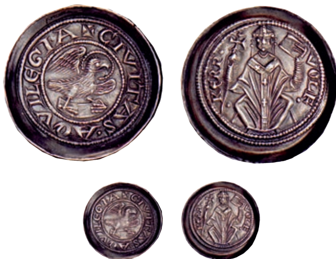
3564 Volkero of Ellenbrechtskirchen (1204-1218). Denaro. ✚ CIVITAS AQVILEGIA. Nimbate eagle r. Rv. VOLF KERP. The seated patriarch facing, wearing mitre, hand holding long cross and book of Gospels. AR 1.13 grams, 5h. Bernardi 12. Extremely Fine. (75-85)

Ex Münzen und Medaillen sale 87, 1998, Lot 370.