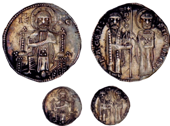
3563 Ranieri Zeno (1253-1268). Grosso. Christ on throne with back, cross nimbate, r. hand on breast, holding book of Gospels in l.; in upper field l. and r., IC and XC. Rv. RA • CENO • S • M • V ENETI, by banner, DVX. Standing facing figures of Ranieri and St. Mark; they hold banner between them. AR 2.16 grams, 6h. CNI 1ff.; Paolucci p. 19, 1. Extremely Fine. (75-85)