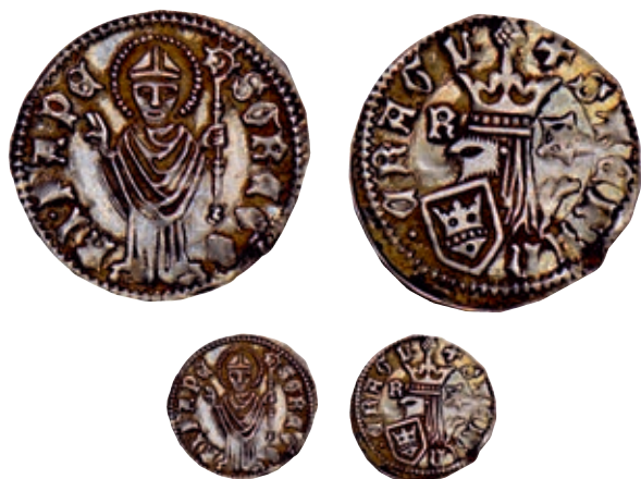
3562 Stephan Tomašević, Despot (1459), King (1459-1463). Dinar. St. Gregory standing facing, nimbate and wearing bishop's vestments, holding crozier and raising r. hand in benediction. Rv. Crowned helmet l. over shield, between R and pentagram. AR 1.08 grams, 3h. Jovanović 2. Rare. Good Very Fine. (425-475)

Stephan Tomašević—also rendered Stipan or Stjepan—was the last despot of Serbia in 1459 and became king of Bosnia in 1461. Sultan Mehmet II invaded Bosnia in 1463 and when support from Venice failed to materialize the royal city of Bobovac soon fell, leaving Tomašević to retreat to Jajce and later to Ključ. The Bosnian Kingdom was soon conquered by the Ottoman Empire. The King was captured in Ključ, and despite promises to the contrary, brought back to Jajce and beheaded on the nearby field known as Carevo Polje (Tzar Fields). Ex Lanz sale 87, 1998, Lot 807.