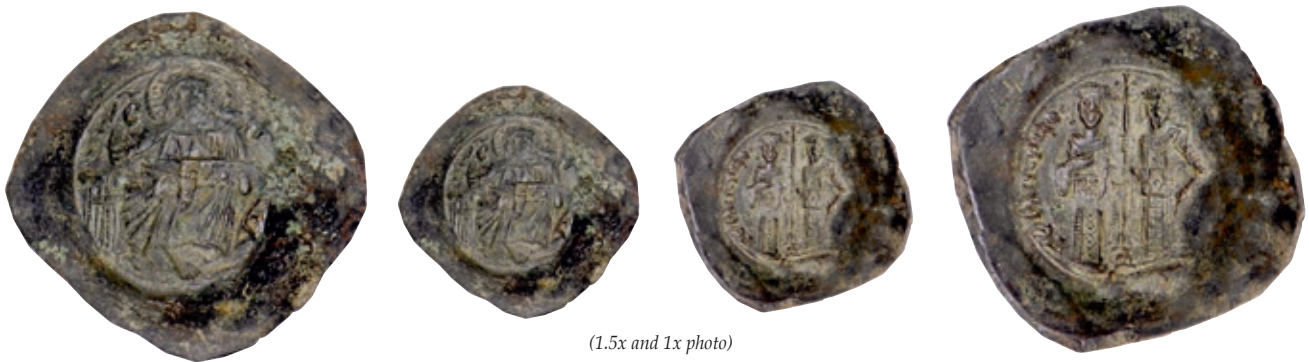
(1.5x and 1x photo)